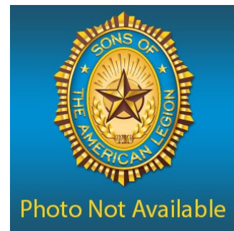
District 2 Vice Commander This position is currently vacant