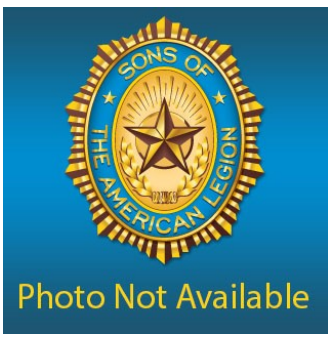
District 8 Vice Commander This position is currently vacant