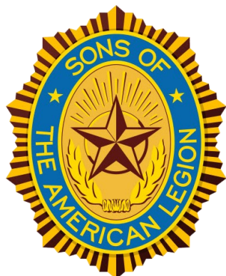
2018-2019 Membership Target Dates: