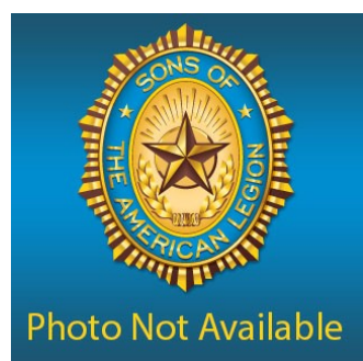
District 3 Commander This position is currently vacant