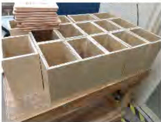
Urn under construction