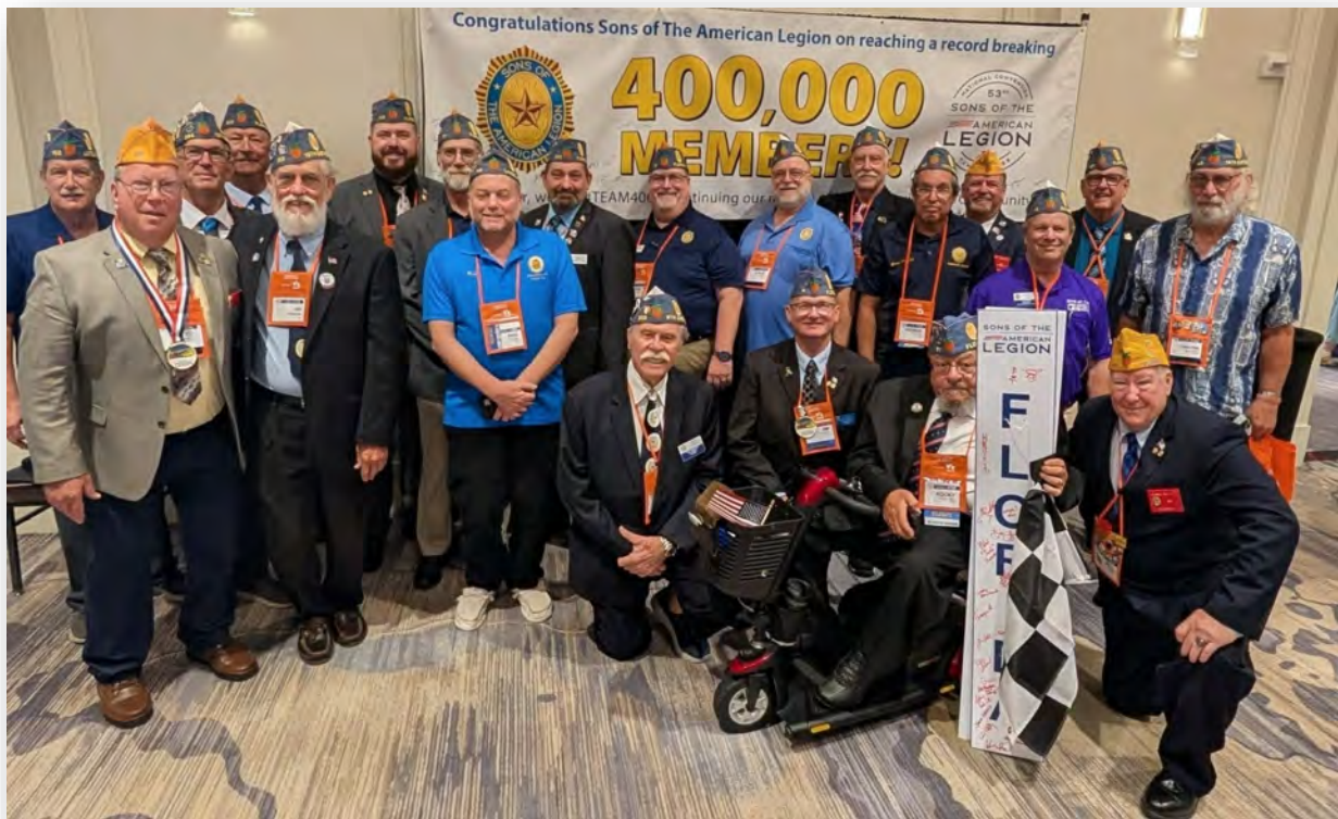
The Florida Delegation at the Sons of The American Legion 53rd National Convention