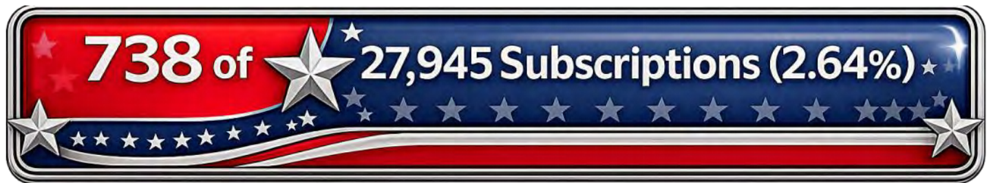
EMAIL GROUP SUBSCRIPTION PROGRESS METER 6/1/26

Again, my goal this year is to have every Area Commander, District Commander and Committee and Commission Chairman submitting articles every month. Ideally, I'd like Squadrons submitting articles regularly as well. 'The Source' is FOR EVERYBODY , not just Detachment Leadership.